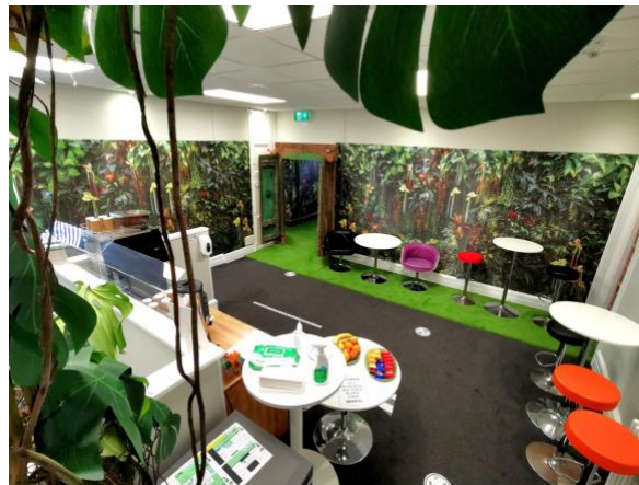
Coffee area Engineers' House (There are also refreshment stands in or outside each meeting room!)

We have kept our prices the same as our last event in 2019, so choose and book your space now! It's on a first-come-first-served basis. But hurry, the Early Bird is 27 April, so don't delay, book today!